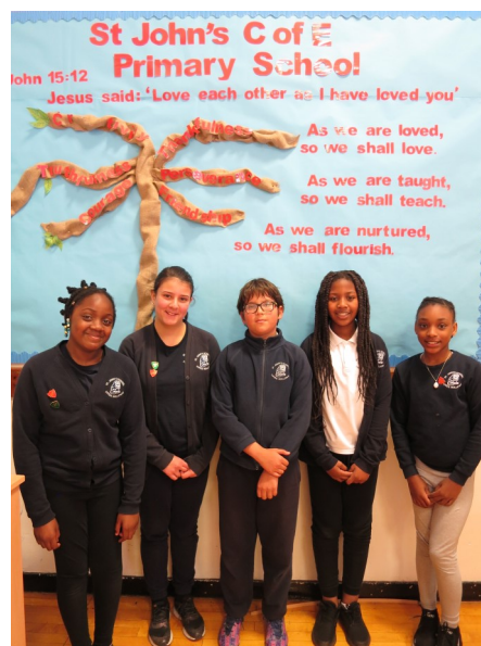
Our Worship Committee