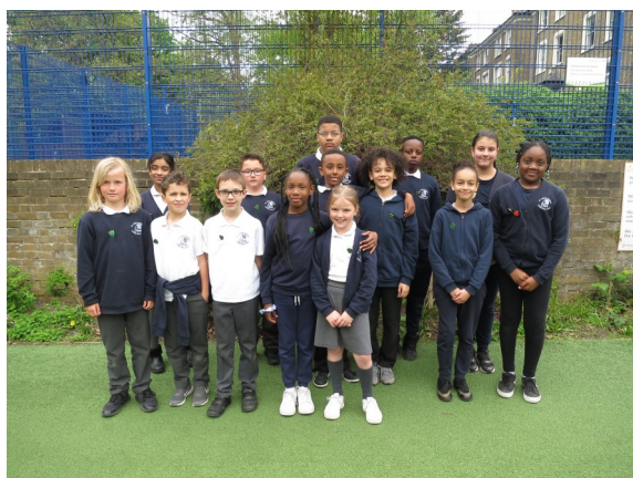
Our brainy science ambassadors