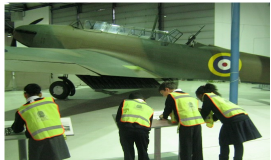
Y4 at RAF Hendon!