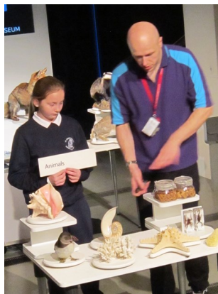
Y6 at the National History museum!