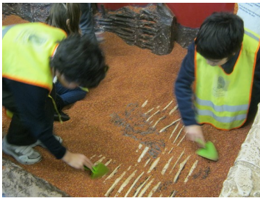
Y3 on a dig at the Jorvik Centre in York!