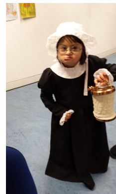
Y1 at the Florence Nightingale museum!