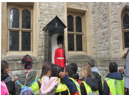
Y2 at the Tower of London!